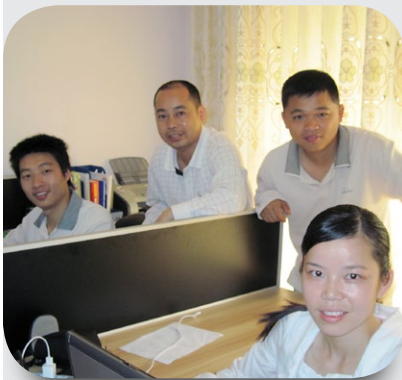
JMMS maintains an office in South China, with experienced specialists monitoring our Asian output

JMMS has the capital resources for ongoing investments in state-of-the-art technologies (CAM-based manufacturing and ERP software), training and continuous improvement in all of our processes. We specialize in tooling for plastic injection molding and zinc/aluminum die casting.