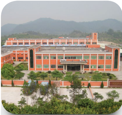
JMMS maintains a global network of skilled, experienced suppliers offering industry-specific tooling capabilities