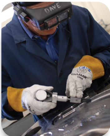
The values of traditional craftsmanship shape everything we do at JMMS, no matter what kind of tools we use

Our next generation approach to mold and die manufacturing combines our specialized skills, in-house resources and partnerships with Asian toolmakers. Together, these assets give you the documented QA and accelerated delivery you need, with highly competitive pricing.